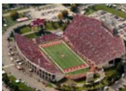
P1-18 | number of units iu memorial stadium