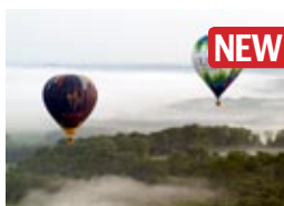
P1-23 | number of units oliver balloons over bloomington