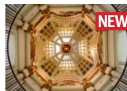
P1-25 | number of units monroe county courthouse rotunda