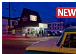
P1-19 | number of units the chocolate moose