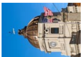
P1-07 | number of units courthouse copper dome 2007