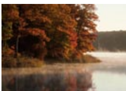
P1-08 | number of units foggy morning