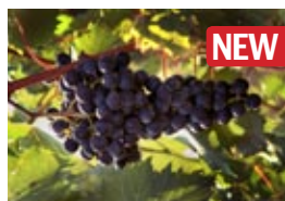
P1-21 | number of units grapes