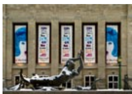
P1-02 | number of units iu auditorium • showalter fountain