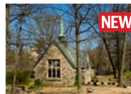
P1-20 | number of units beck chapel