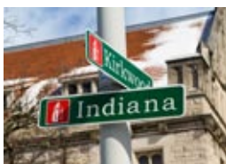
P1-03 | number of units kirkwood & indiana avenue