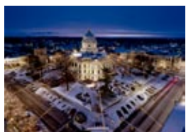
P1-06 | number of units canopy of lights