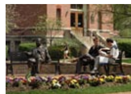
P1-10 | number of units herman b. wells sculpture