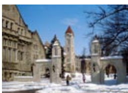
P1-13 | number of units iu sample gates