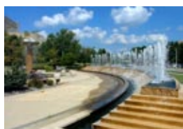
P1-11 | number of units iu simon music center, mckinney fountain