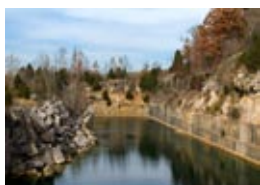
P1-12 | number of units breaking away quarry