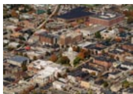
P1-01 | number of units aerial of downtown bloomington