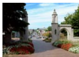
P1-14 | number of units iu sample gates • kirkwood avenue