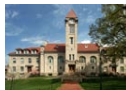
P1-15 | number of units iu student building