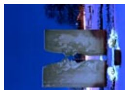
P1-09 | number of units four faces