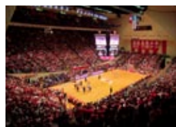
P1-04 | number of units iu assembly hall