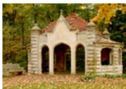
P1-17 | number of units iu rose well house