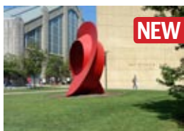
P1-22 | number of units indiana arc, indiana university art museum