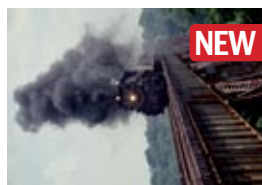
P1-26 | number of units tulip trestle viaduct