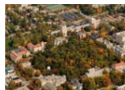
P1-05 | number of units iu dunn's woods